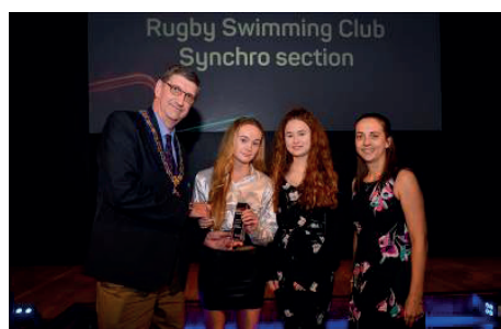
Rugby Synchro Club receiving Club of the Year award