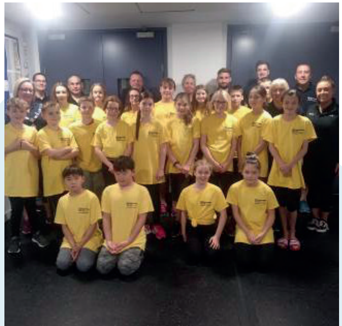
Swimmers at the Shropshire County Pathway Camp