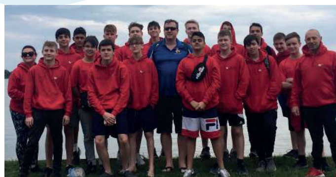
West Midlands boys training camp to Serbia