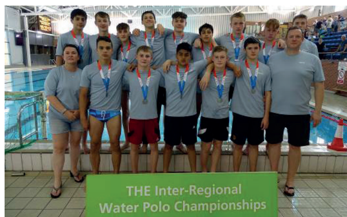
U 16 West Midlands Inter-Regional Team