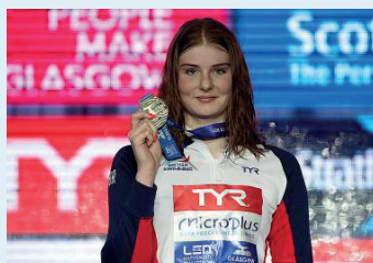
Freya Anderson winning gold at the European Short Course Championships