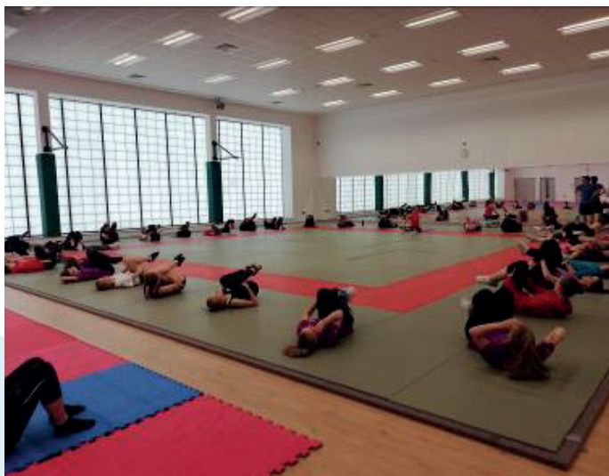
Midlands Synchronised Swimming Summer Training Camp 2019

Geraldine Lally Midlands Synchro Camp Coordinator