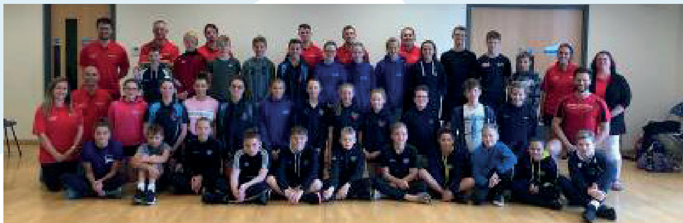
Swimmers at the West Midlands Regional Development Camp